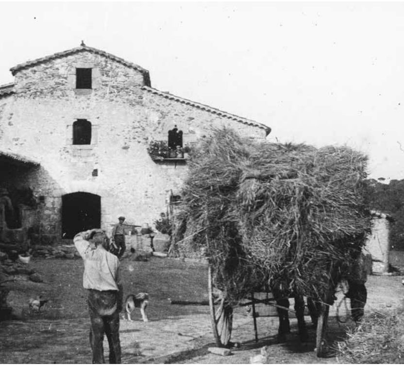
© Antoni Gallardo i Garriga (CEC Archive)