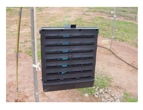
Figure 7 Theyson trap