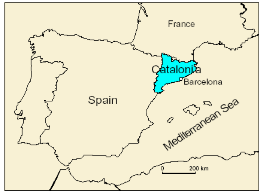
Figure 1. Catalonia region in Spain

The first Ips Sexdentatus outbreak at this kind in Catalonia region (Figure 1) was in 1994.