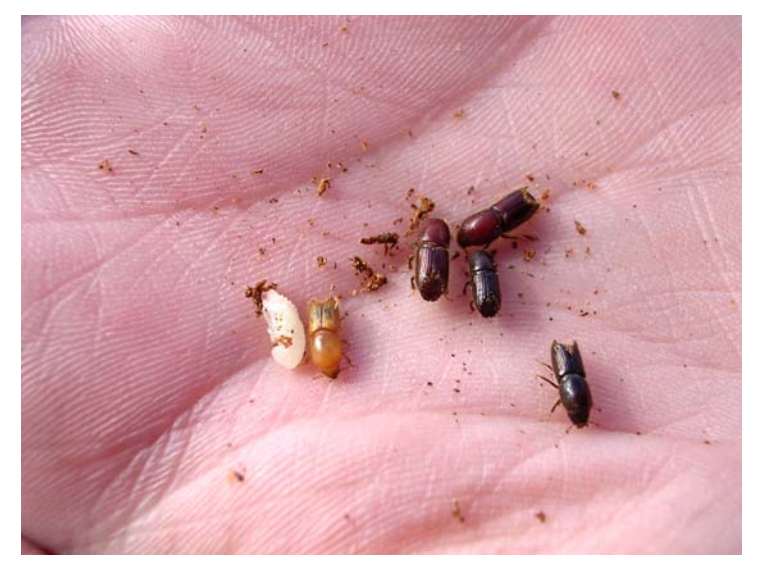
Figure 4. Some Ips sexdentatus individuals

Taxonomic position: Insecta: Coleoptera: Scolytidae Common names: Six-toothed bark beetle (English) Stenographe (French) Grosser 12-zähniger Kiefernborkenkäfer (German) Tolvtannet barkbille (Norwegian)