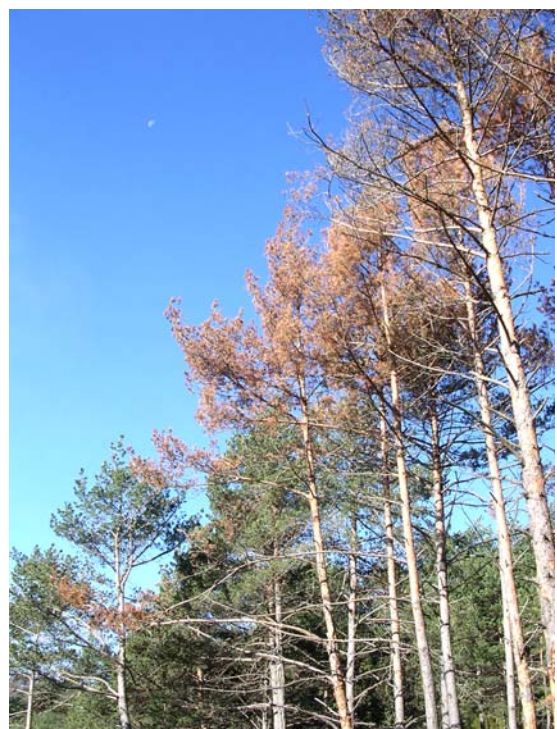
Figure 5. Damaged trees in Montesquiu Castle Park neighbouring area

This species is of no significance as a pest in northern and central Europe, where it breeds only in fresh logs or in weakened or dying trees. It has caused death of Pinus sylvestris and P. radiata suffering from drought stress in central and southern France, northern Spain and Portugal (Goix, 1977; Perrot, 1977; Lieutier, 1984; Ferreira & Ferreira, 1986; Lieutier et al., 1988; Paiva et al.,1988; Cobos-Suarez & Ruiz-Urrestarazu, 1990), often in association with other pests (I. acuminatus, Tomicus piniperda). Outbreaks have occurred on Picea orientalis in Turkey (Schimitschek, 1939; Schönherr et al., 1983). Its caused death in Pinus sylvestris stands in present case does not cause big economic losses to Montesquiu Castle Park but is an economic problem for the owners of neighbouring stands. Therefore successful handling of the problem in Park and used practical measures are useful for other forest owner with similar problems as they can use