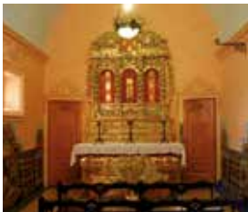
The castle's chapel

The residence was expanded and embellished by Lluís Descatllar, who was also responsible for the construction of the current chapel and the extension of the north-western section of the castle.