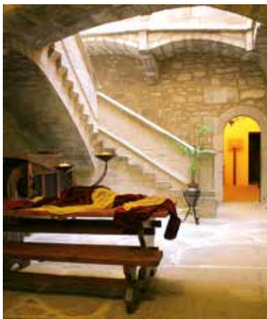
The castle's main staircase added during the work undertaken between 1917 and 1920.

Today, Montesquiu castle has re-established its links with the region and forms a part of the park.