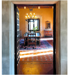
Ceremonial rooms of the castle

Times change, the nobility gives way to a powerful commercial and industrial bourgeoisie. The castle of Montesquiu, caprice and expenditure of the Juncadella heirs.