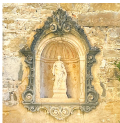
Chapel of Santa Barbara

Wars, power and abject poverty in the emerging modern Catalonia. The Lord of Besora struggles to maintain his power in an unequal and changing Bisaura.