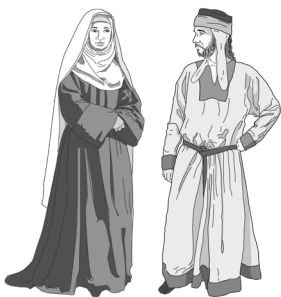
Gombau de Besora and Ermessenda de Carcassonne, key figures of the Early Middle Ages

The defence tower above the river Ter rises under the watchful eye of the great castle of Besora.