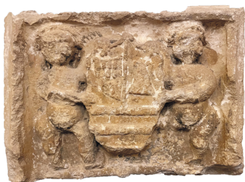
Coat of arms of Besora