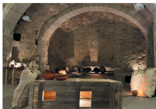
Medieval scenography in the cellar hall

Feudalism in the Bisaura consolidates the Besoras as great lords of a system that subjugates the peasants under their power.